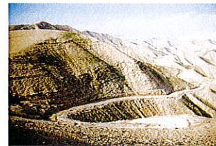
The view from one of my favorite camping spots