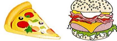
A couple of my favorite meals